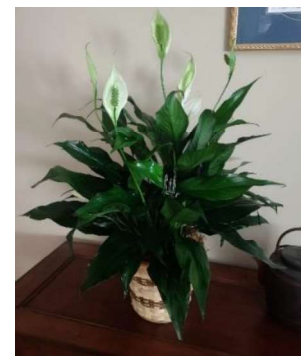
A funeral bouquet from the Fellowship and a peace lily from the Caring Network.