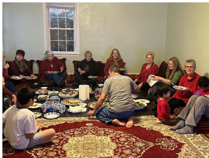
Our Afghan family treated the Home Team and their English tutors to a magnificent feast in traditional Afghan style. They all had so much fun!